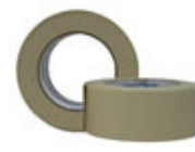
ST 17 Masking Tape

Sample Size: 24mm x 55m (1" x 60 Yards) Std Sizes: 12mm x 55m (1/2" x 60 yards) 18mm x 55m (3/4" x 60 yards) 36mm x 55m (1-1/2" x 60 yards) 48mm x 55m (2" x 60 yards) Manufacturer: SpecTape Colors: Description: Utility grade masking tape with medium to high adhesion level and designed for use in general purpose packaging, bundling, splicing and banding applications.