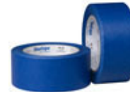
CP 27 Masking Tape

Sample Size: 24mm x 55m (1" x 60 Yards) Std Sizes: 12mm x 55m (1/2" x 60 yards) 18mm x 55m (3/4" x 60 yards) 36mm x 55m (1-1/2" x 60 yards) 48mm x 55m (2" x 60 yards) Manufacturer: Intertape Colors: Description: Performance grade masking tape with excellent resistance to high temperature, solvents and paints that make it a versatile choice for a wide range of industrial applications.