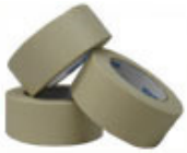
ST 7 Masking Tape

Sample Size: 24mm x 55m (1" x 60 Yards) Std Sizes: 12mm x 55m (1/2" x 60 yards) 18mm x 55m (3/4" x 60 yards) 36mm x 55m (1-1/2" x 60 yards) 48mm x 55m (2" x 60 yards) Manufacturer: SpecTape Colors: Description: Premium grade masking tape with high temperature resistance and commonly used in the automotive and construction industries.